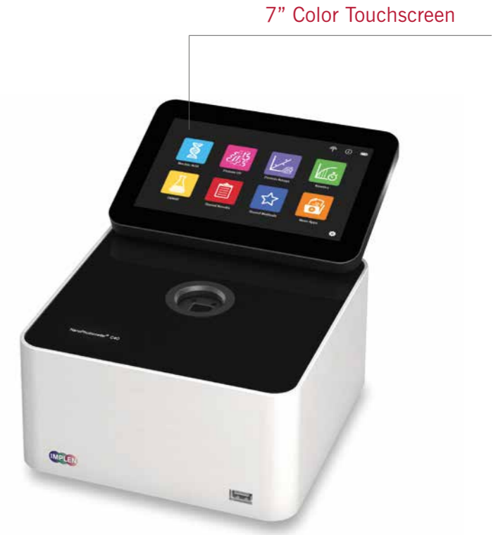
7" Color Touchscreen