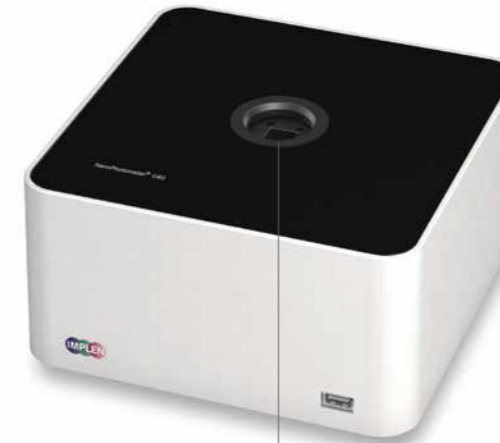
Temperature Controlled Cuvette Holder